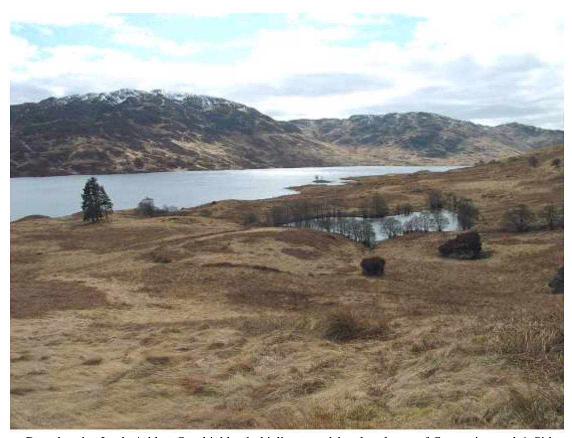
Bruach – by Lock Arklet. Our highland shieling stood by the clump of Scots pine and 1 Sitka spruce cnetre left. We vacated around 1940 to make way for WWII – the glens were taken over by the army and used as the largest ammunition dump in Europe. The glen was only bombed once during the night of 14-15<sup>th</sup> May, 1941 and destroyed the post office in Inversnaid Hotel but harmed no one. The story is that there was a suspected foot and mouth disease in the cattle. To be on the safe side, they started burning the cattle. However, this was a time of the year when the bracken is still brown (as it is in the photo) and so the fire spead into the bracken. At time the shipyards on the Clyde to the south were being bombed. So there is speculation the pilot was a little astray and seeing the bracken fire mistook it for the burning shipyards and dropped his load. We will never know what the pilot was thinking.

A few years after the war we returned to the Trossachs and settled into one of the rare wooden houses in the slate quarry village atop the Duke's pass. This was extremely primitive living since the toilet was a hut on the bog and although we were one of the few to have 'tap' water, it was much less preferable to the well-oxygenated "running water" of clean, fresh stream used for drinking water above and bathing below the houses. About 20 families lived here until the quarry closed around 1962. These were very hard times for workers, but for a child returning to his ain hirsel this was a land of great beauty and a joy to explore from dawn to dusk.