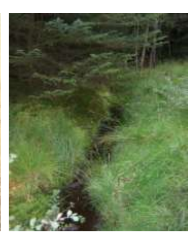
My carving of hill draining tools and One of my drains in Duchray still working after 50 years

The peat lands were mostly small heather bogs and grassy fens up to about 100 acres in size. We drained all them up to the tree line about 1500 feet elevation. Our ditching was not restricted to peaty soils; for we also cut drains in shallow mineral soils simply to provide planting turves to make the trees grow better among the heather, bracken and sedge.